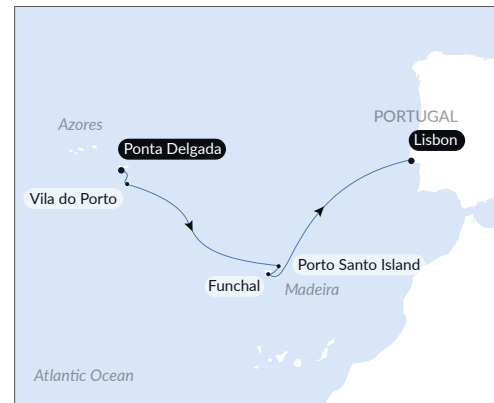
22nd July 2027 departure: reverse itinerary.

In the heart of summer, Madeira and the Azores reveal themselves between vertiginous cliffs, mist-shrouded calderas and refreshing levadas (irrigation channels) in the hollows of the mountains. From volcanic panoramas to cities of character, from Funchal to Ponta Delgada, discover the architectural treasures and cultural heritage of these Lusitanian archipelagos.